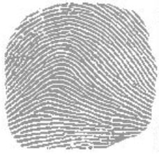
The Plain Arch

Students should examine their own fingerprints. The following patterns may be observed: