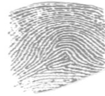
The Tented Arch

Variation: Making your own fingerprint card can be done using everyday supplies. You'll need index cards, a pen, a No. 2 pencil, scissors and transparent tape. Rub a sharpened No. 2 pencil on your fingertip, covering the entire area. Use a piece of transparent tape to "lift" this shaded area from your fingertip. Ask a classmate to assist in this process. Place the tape onto an index card and label it. You can repeat the process for all ten fingers and create your own "ten-print" fingerprint set.*